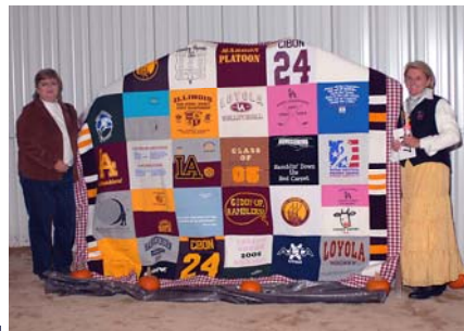
"A special thanks to Agi Cibon for her amazing talents"

In-kind Donation Support for the Hoe-Down is listed on the Following Page